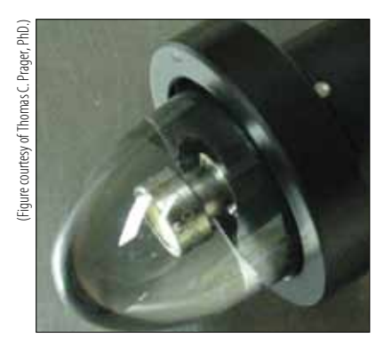
Figure 4. The ClearScan cover on the ultrasound allows for ease of use without the need for an open waterfilled shell.

improved accuracy of measurements increases the ability to ensure adequate clearance of the endothelium after IOL implantation. In addition, dislocated or malpositioned IOLs can be accurately measured with UBM, aiding significantly in surgical revisions (Figures 1 and 2). Without UBM, it is