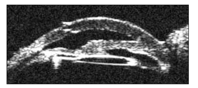
Figure 1. This patient had prior Descemet stripping endothelial keratoplasty (DSEK) and IOL implantation. Fibrosis at the intersection of the DSEK tissue and the iris likely led to the implant's dislocation.

UBM technology is particularly useful for surgical planning for phakic IOL implantation. Although it is recommended that we use anterior chamber depth, white-to-