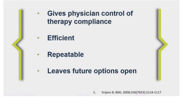
Figure 1. SubCyclo offers better control of outcomes in chronic disease management.

Fourth, we desire to leave future options open. For example, we do not perform any procedure that would negatively affect the conjunctiva or Schlemm canal if we will need to perform another procedure in the future.