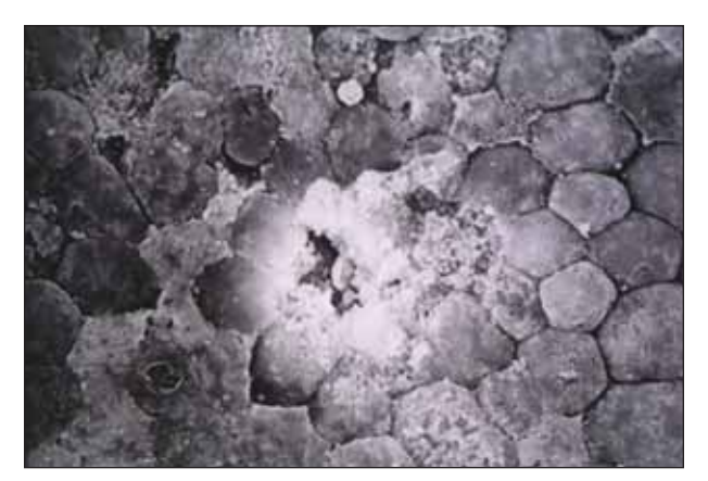
Figure 2. Scanning electron microscopy shows that RPE cell damage was restricted to a small number of cells after micropulse laser treatment.

Using a micropulse mode, laser energy is delivered with a train of repetitive short pulses (typically 100 to 300 microseconds "on" and 1700 to 1900 microseconds "off") within an "envelope" whose width is typically 200 to 300 milliseconds.<sup>24</sup> Micropulse power as low as 10% to 25% of the visible threshold power has been demonstrated to be sufficient to show consistent RPE-confined photothermal effect with sparing of the neurosensory retina on light and electron microscopy.<sup>25</sup> Tissue-sparing protocols are designed to produce only