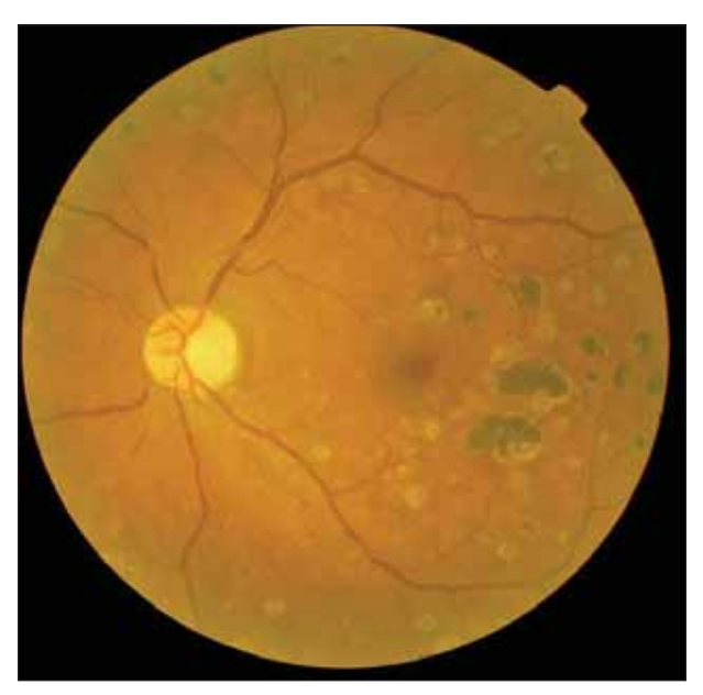
Figure 1. Heavy laser burn.

Since its inception, retinal photocoagulation has become more refined, effective, and safe. It has become the first line of treatment for numerous chorioretinal disorders, and its efficacy has been validated by many clinical studies. Laser photocoagulation may produce its therapeutic effects by destroying oxygen-consuming photoreceptor cells and retinal pigment epithelium (RPE), thereby reducing the hypoxic state of the retina. This concept is increasingly being challenged as therapeutic agents such as steroids and anti-vascular endothelial